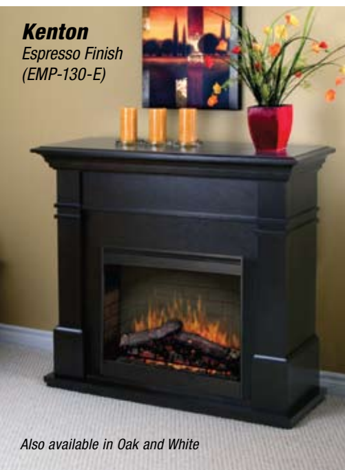
Kenton Espresso Finish (EMP-130-E)