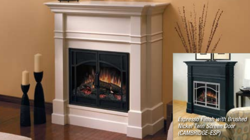
Espresso Finish with Brushed Nickel Twin Screen Door (CAMBRIDGE-ESP)

Antique White Finish with Black Twin Screen Door (CAMBRIDGE-AW)