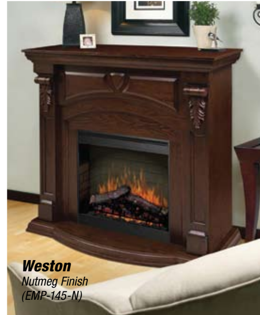
Weston Nutmeg Finish (EMP-145-N)