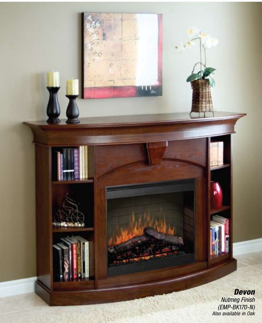
Devon Nutmeg Finish (EMP-BK170-N) Also available in Oak