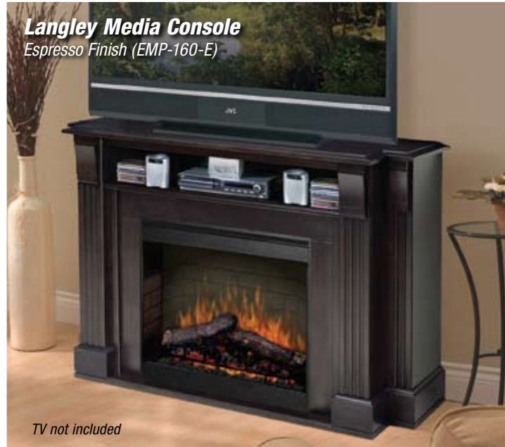
TV not included