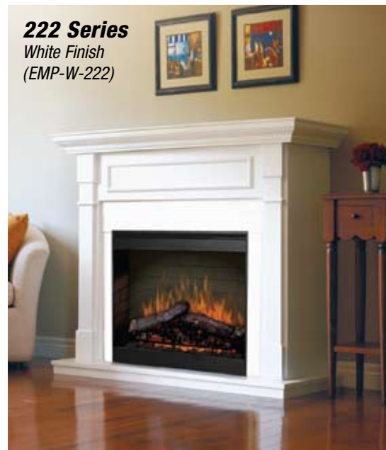
222 Series White Finish (EMP-W-222)