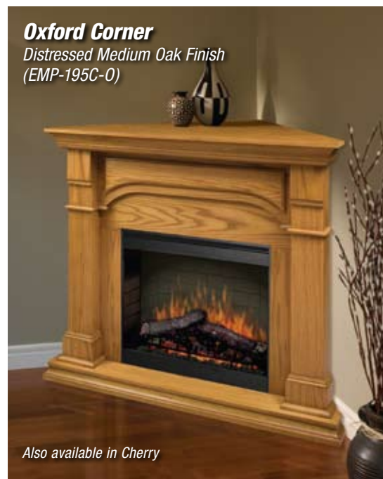
Oxford Corner Distressed Medium Oak Finish (EMP-195C-O)