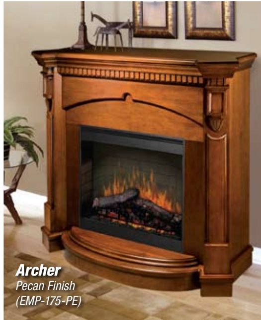
Archer Pecan Finish (EMP-175-PE)