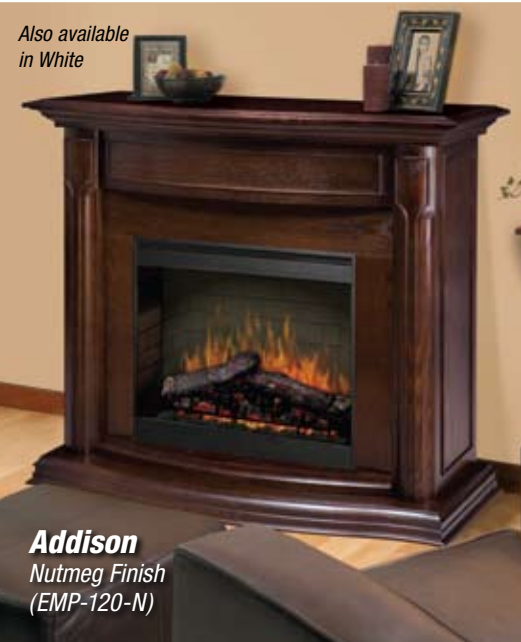
Addison Nutmeg Finish (EMP-120-N)