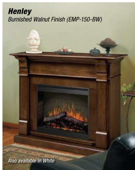
Henley Burnished Walnut Finish (EMP-150-BW)