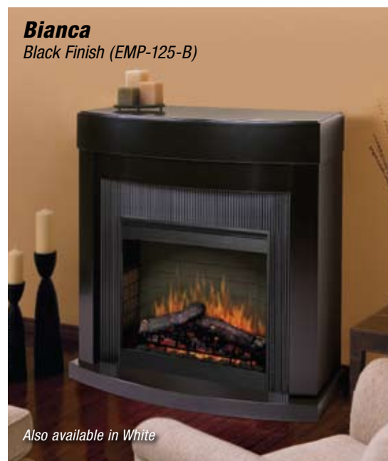
Bianca Black Finish (EMP-125-B)