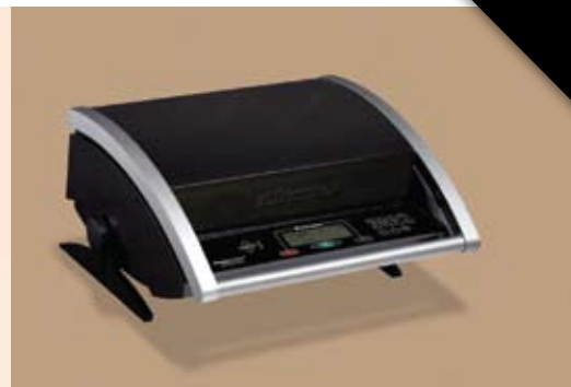
PowerChef Convertible tabletop electric grill