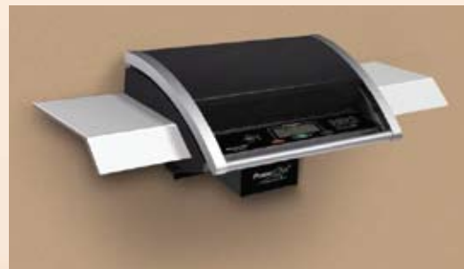
Shown with wall mount bracket and side shelves (sold separately)