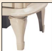
Cast metal legs