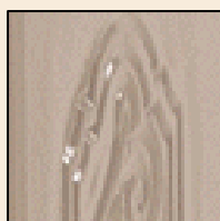
Carved side panels