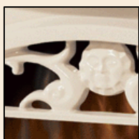
Cast metal front

Reminiscent of old-world craftsmanship, this elegant gloss cream finish stove design harkens back to a less complicated era for a soothing, finishing touch in any room.