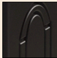
Carved side panels