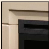
Stepped firebox enclosure

This contemporary fireplace is made of glass reinforced concrete in a taupe finish. The Mason features a new slim design (under 12" depth) which makes it suitable for any size room and its flat side design allows baseboard trim to fit flush to cabinet.