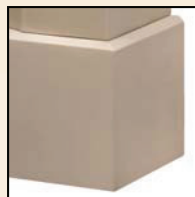
Full hearth enclosure