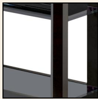
Easy access to storage