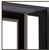
Smoked glass shelves